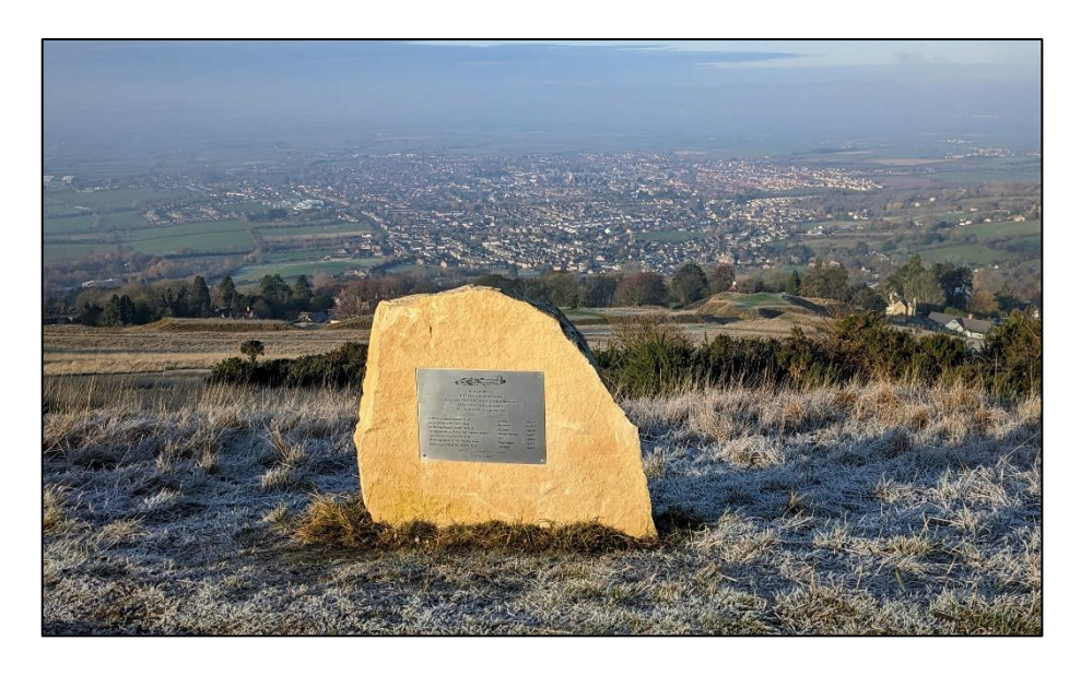
The memorial to the crew of MZ311 on Cleeve Common

Cleeve Common Trust has erected a memorial to the crew members of MZ311.