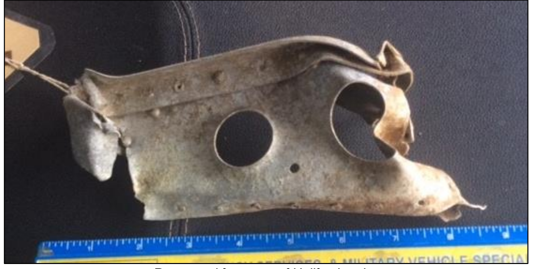
Recovered fragment of Halifax bomber

The most conclusive evidence for the location comes from the chance discovery of a small fragment of the wreckage among gorse bushes in August 2020. The fragment bears serial numbers which positively identify it as part of a Halifax bomber, probably a section of an outer wing.