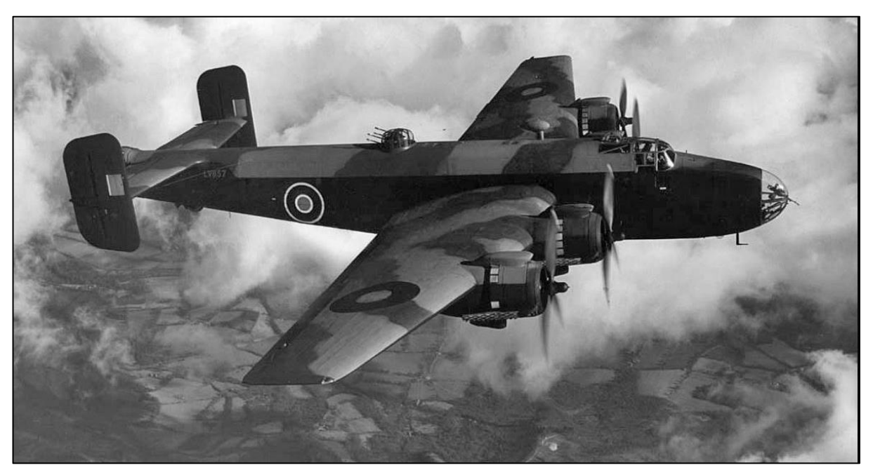
Handley Page Halifax Mk III bomber

In the early hours of the morning of Saturday 26 August 1944, an RAF Halifax bomber crashed into the escarpment of Cleeve Hill, near Cheltenham in Gloucestershire. All seven of the mixed Canadian/British crew lost their lives.